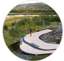
Formal Viewing Platform Storberget Viewpoint and Rest Stop, Pushak