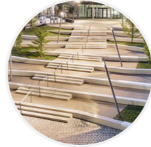
Seating Steps Universitätsterassen Koeber Landschaftsarchitektur