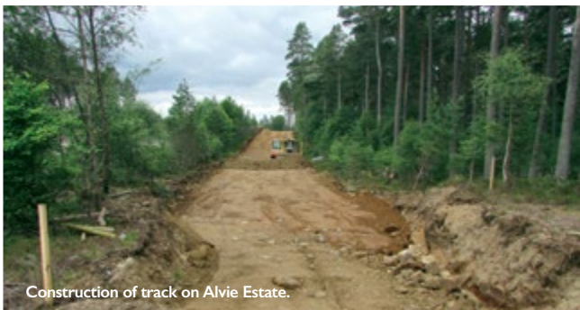
Construction of track on Alvie Estate.

As access tracks to and from the A9 are closed it is necessary to upgrade some of the existing tracks as well as construct new ones to improve access and movement within the estates. Work on this is well underway with approximately half of Dunachton Estate tracks and a quarter of Alvie Estate tracks now complete.