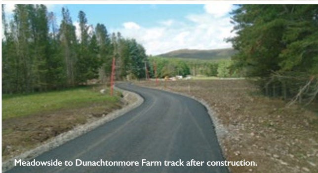
Meadowside to Dunachtonmore Farm track after construction.