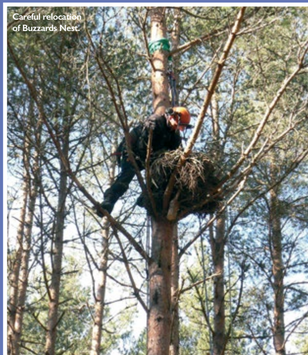
Careful relocation of Buzzards Nest.

Monitoring has continued over the months and we are pleased to report that the pair of buzzards have favoured the new nest location and potential breeding may occur this year.