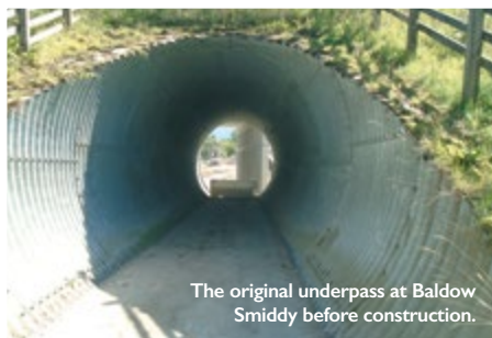
The original underpass at Baldow Smiddy before construction.