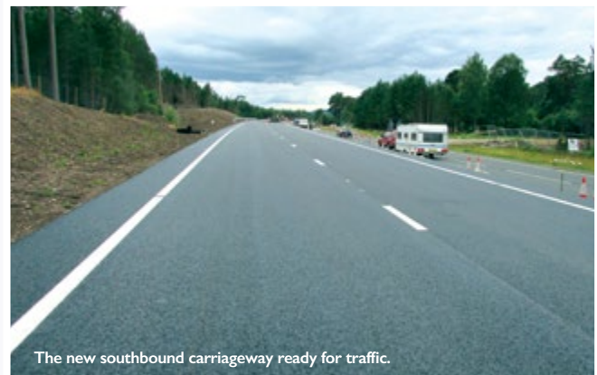
The new southbound carriageway ready for traffic.

on a section of the new southbound carriageway. Traffic has been switched on to the new road allowing construction work to begin on the existing road.