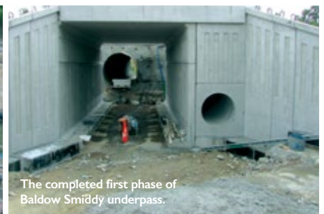
The completed first phase of Baldow Smiddy underpass.

The first phase of construction is now complete on all four underpasses at – Dunachton, Baldow Smiddy, Lower Milehead and Allt An Fhearna – as well as Leault Burn culvert.