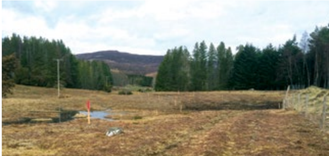
Meadowside to Dunachtonmore Farm track before construction.