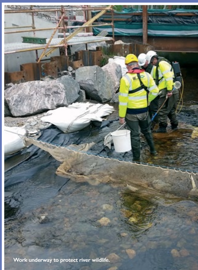
Work underway to protect river wildlife.

We would like to thank Spey Fisheries for their ongoing guidance and involvement with the scheme to date.