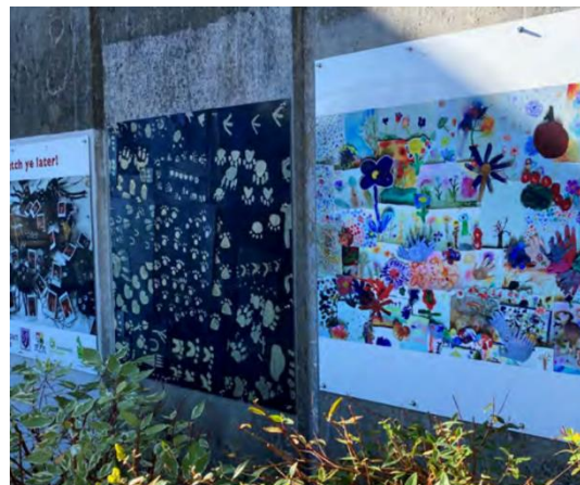
The new artwork at Dalry station