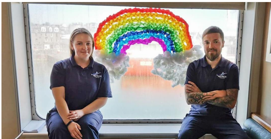
Staff on board the M.V. Hjaltland created a rainbow of hope on the ship