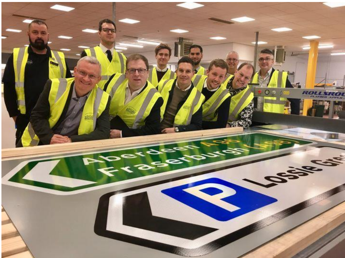
BEAR Scotland and Scotland's Bravest Manufacturing Company - an award winning partnership