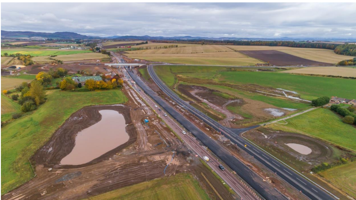
Aerial view of the Luncarty Link Road