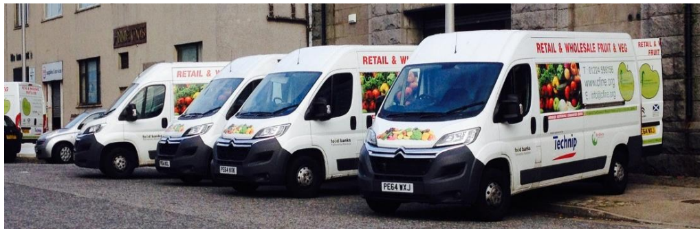
The CFINE fleet – ready for deliveries