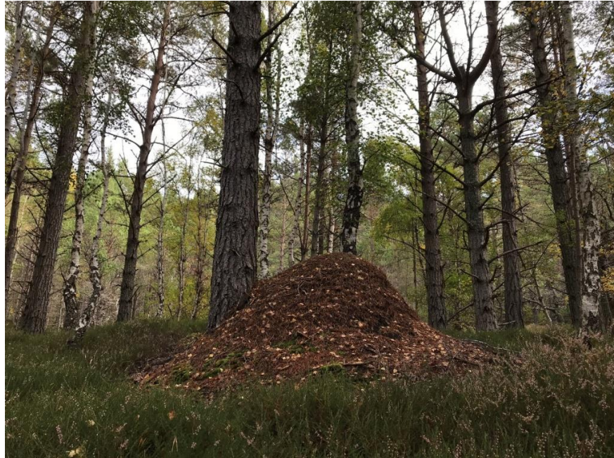
Wood ant nest within woodland surveyed as part of proposed Aviemore to Carrbridge Non-Motorised User scheme