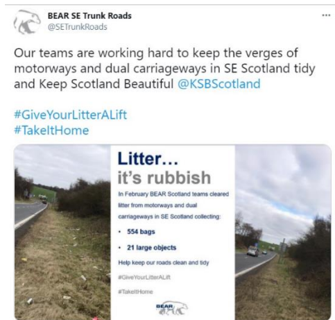
A 'tweet' promoting #takeithome