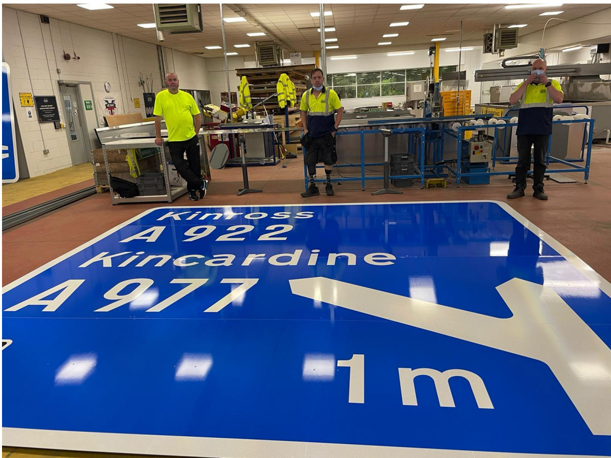
A road sign produced by Scotland's Bravest Manufacturing Company

SBMC provides employment and development opportunities for Armed Forces Veterans and others with disabilities in Scotland who may need support adjusting to life after service, enabling them to move forward in a supportive, professional workplace, delivering high quality products and services.