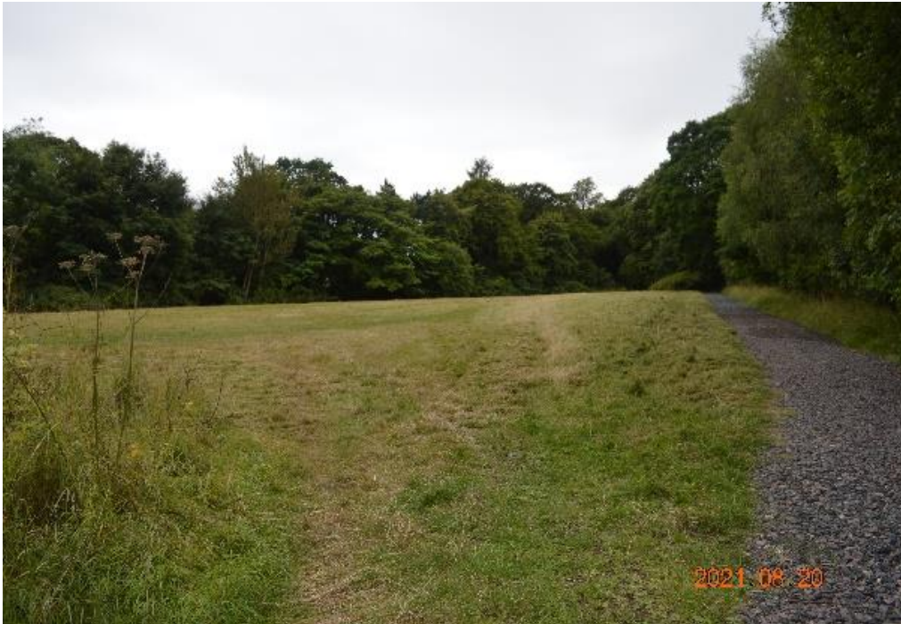
Renewed footpath at Viewpark Conservation Group