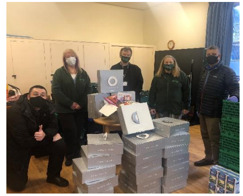
Hampers donated to Glasgow North Foodbank