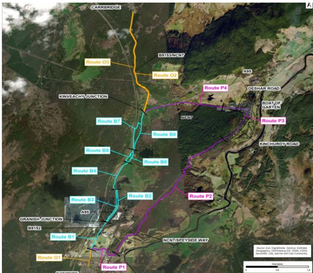
Plan of route options on the scheme