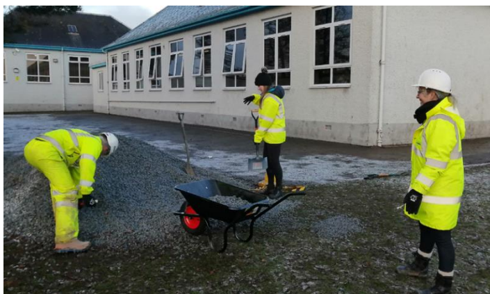
Hard at work moving 10 tonnes of gravel by hand