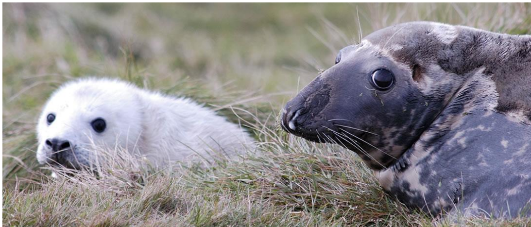
Grey Seals in Orkney