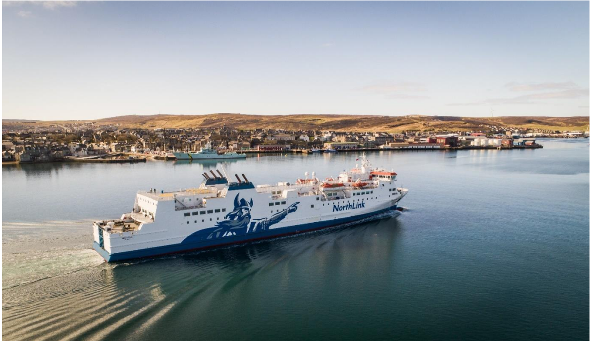
NorthLink Ferries MV Hjaltland, Lerwick