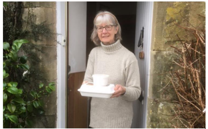
Volunteers delivered festive themed boxes