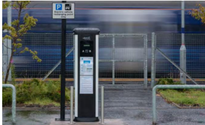
One of the new electric vehicle charging points