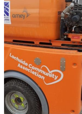
Mini gritter 'Lochside Community Association'