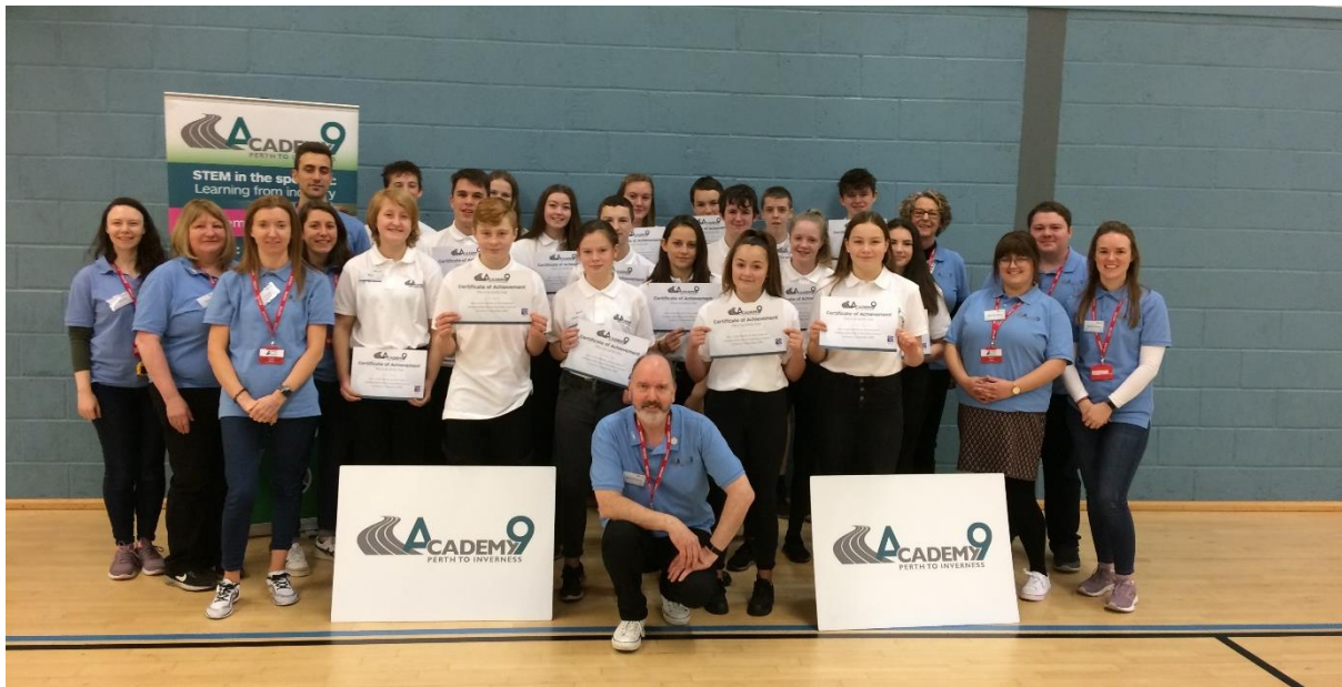
Members of the Academy9 team with S3 mentors from Grantown Grammar at their Gateway training. (Photo taken pre Covid-19).

Academy9 aims to maximise the benefit of the A9 Dualling programme by infusing elements of the various activities involved in this major infrastructure project into the education curriculum. As well as providing added value to community engagement, we are increasing pupils' awareness of science, technology, engineering and mathematics (STEM) and civil engineering-related careers. During the periods of lockdown no external Academy9 STEM activities could take place, so some of our activities were converted to an online format.