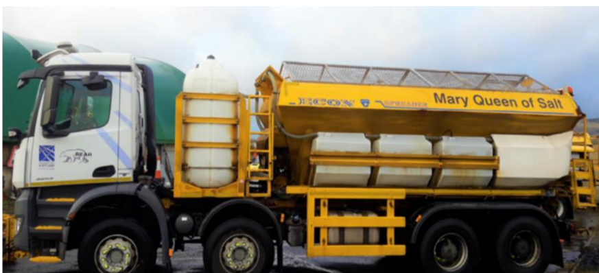
Mary Queen of Salt