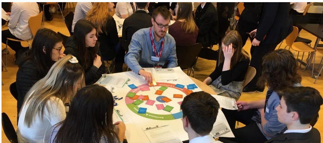
Next Steps Conference at Kingussie High School. Photo taken pre-Covid-19.