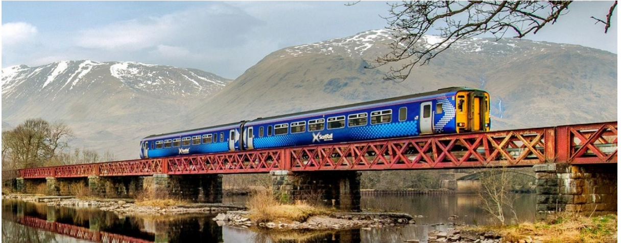
Train travelling on the picturesque West Highland Line