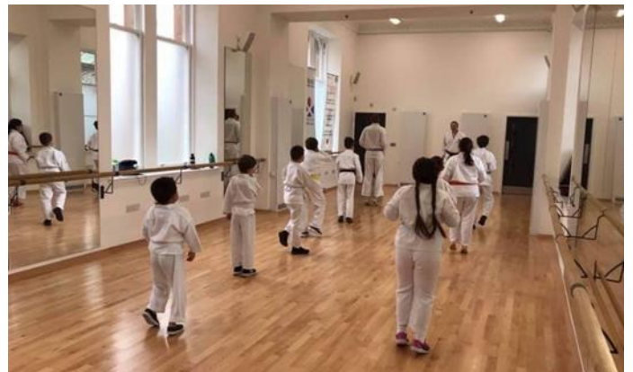
Shibumi Karate Club members training in the updated station