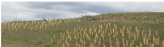
The biodegradable tree shelters being utilised in an area of planting adjacent to a SuDS pond