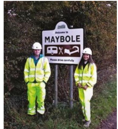
Two new apprentice graduates on the project are local to Maybole.