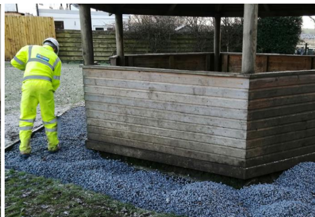
Levelling off gravel around the outdoor classroom