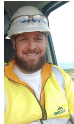
One of the Project Recce participants received two job offers after his placement

To the end of March 2021, eight veterans had completed placements, resulting in two job offers from project supply chain partners. Further details are available in the Autumn 2020 Project Newsletter