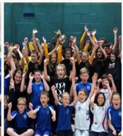
Beneficiaries of the CalMac Community Fund.