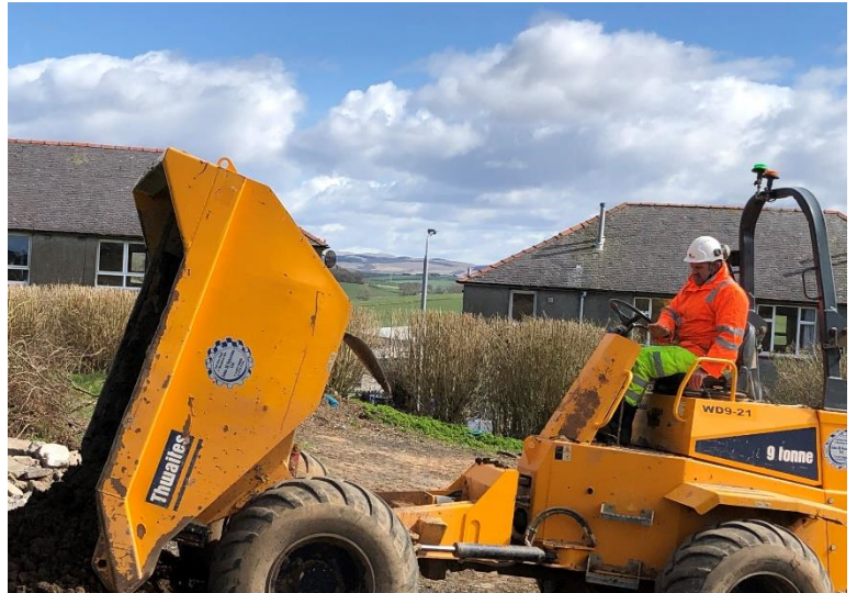
Topsoil was provided to assist the Carrick Community Food Garden in growing their own produce