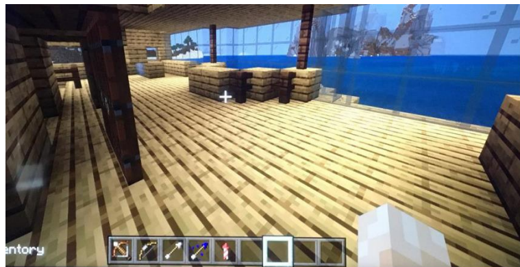
Internal 3D design using Minecraft by Blairgowrie High School team