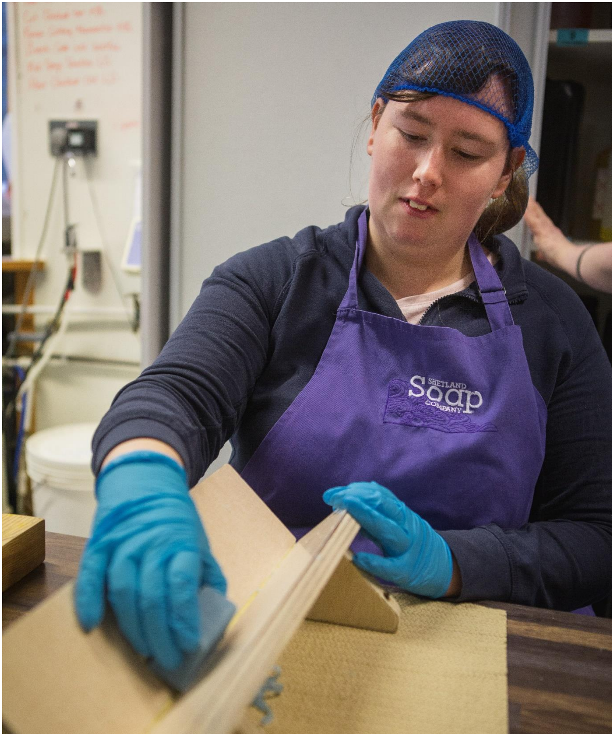
The Shetland Soap company have supplied the Northern Isles Ferry Service for the last 12 years