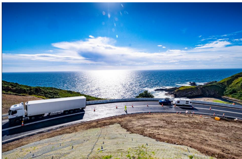
The new improved section of the A9 at Berriedale Braes opened to traffic in August 2020