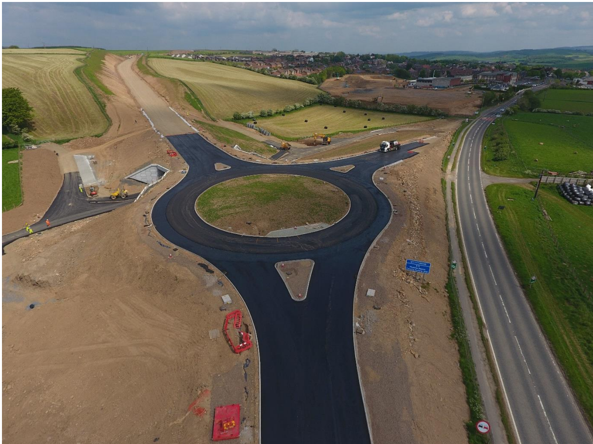
Construction of the new roundabout at Broomknowes