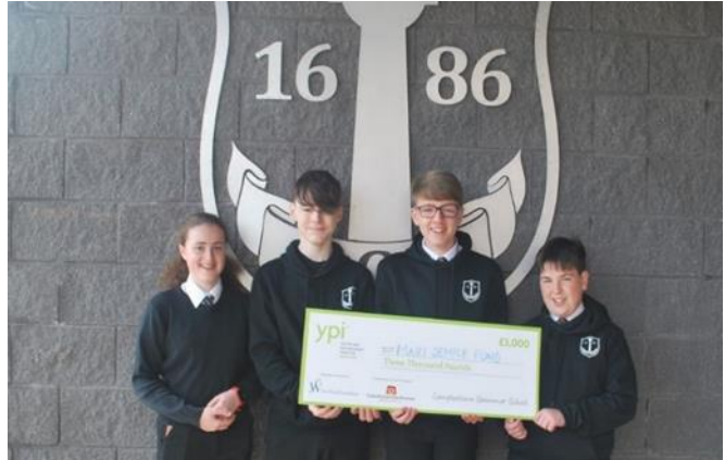
Pupils from Campbeltown Grammar School, one of the schools partnered in the Youth and Philanthropic Initiative, collect an award for their involvement on the scheme.