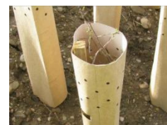
A tree shelter