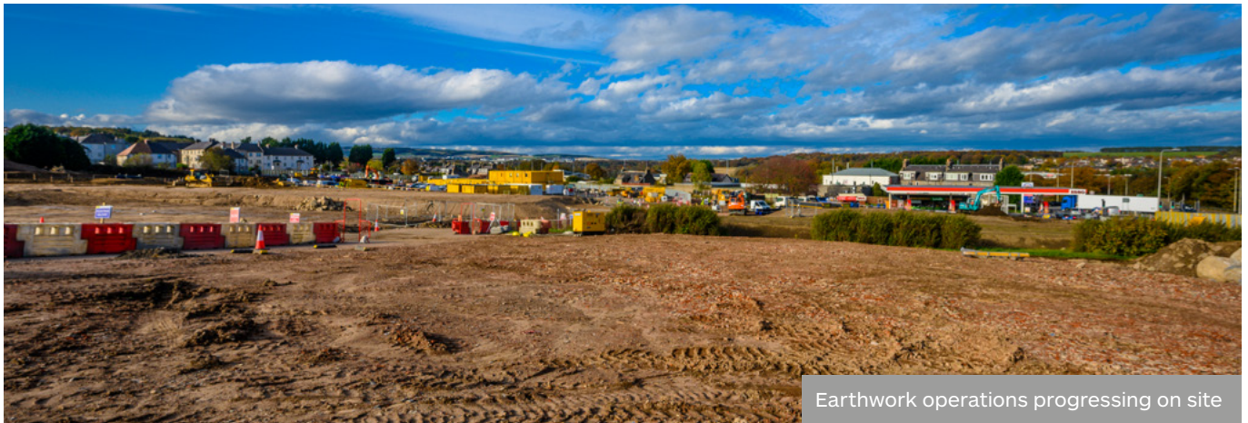
Earthwork operations progressing on site