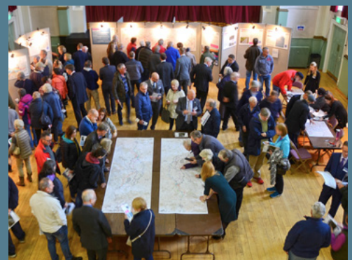
Members of the public at a public exhibition

The event will be held on Tuesday 10 December 2019 from 4pm to 7pm at the Lord Provost Henry E Rae Community Hall, The Hub, Manor Avenue AB16 7UR.