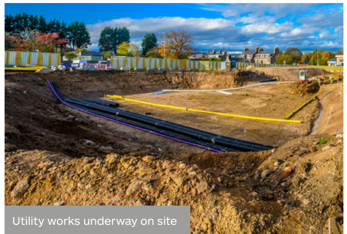
Utility works underway on site

The installation of pipes to form the drainage network for the new road will be the next main stage of drainage works.