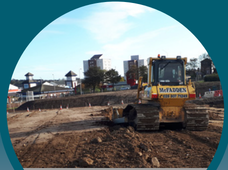
Earthworks get underway