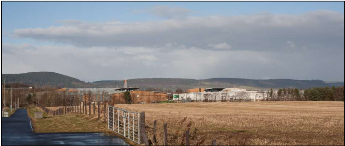
Photograph 10.8: View of Inverness Retail and Business Park From the New Path Within Inverness Campus