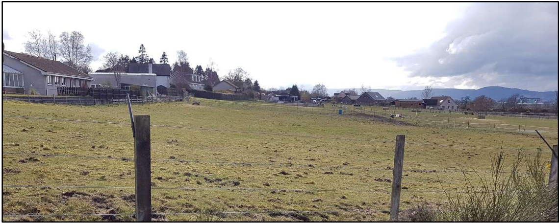
Photograph 10.15: View of the residential dwelling and garage under construction in Resaurie.

scheme to the north-west would be limited. The visual receptors at this location would be of high sensitivity.