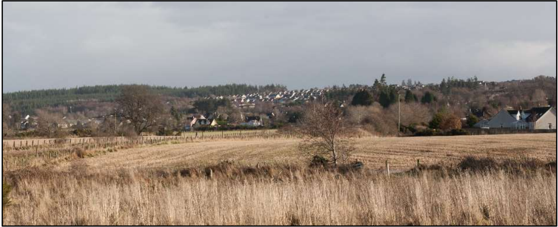
Photograph 10.4: View of Smithton and Westhill From Farmland to the North