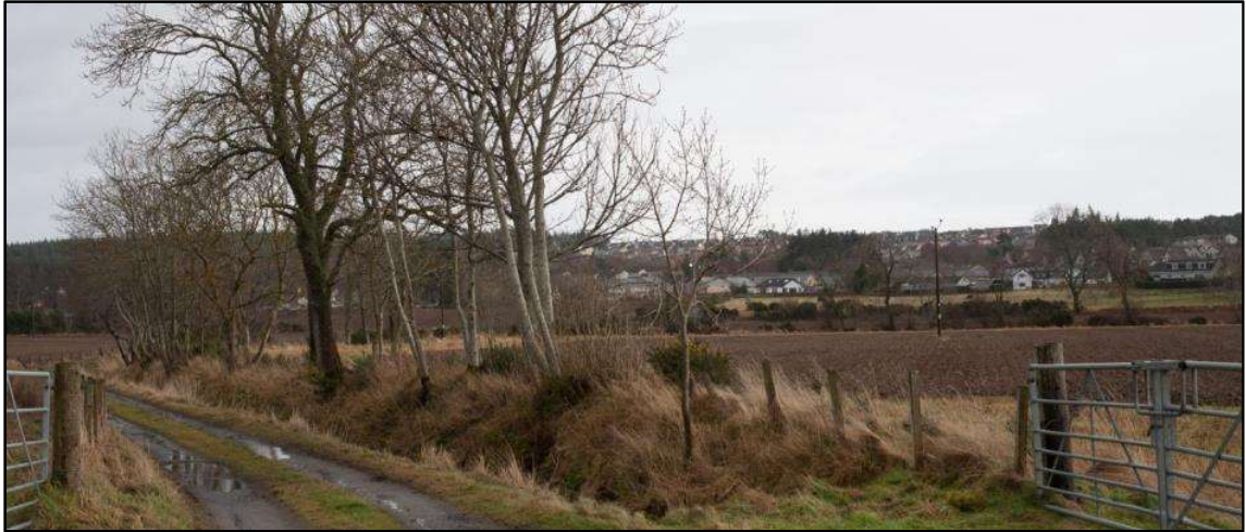
Photograph 10.17: View from Core Path IN08.10 at Ashton Farm looking south towards the Proposed Scheme and Cradlehall