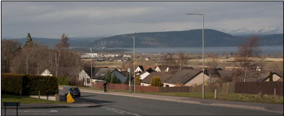
Photograph 10.6: View from U1124 Caulfield Road in Westhill looking north-west towards the proposed scheme and Kessock Bridge and Black Isle