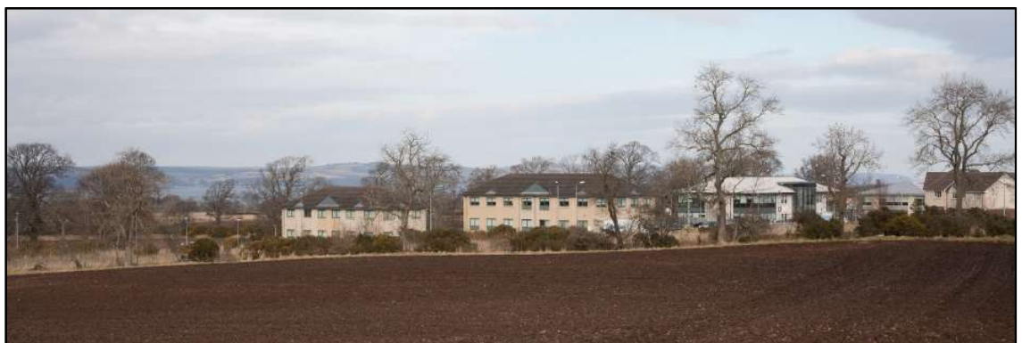
Photograph 10.3: Cradlehall Business Park Viewed from Inverness Campus