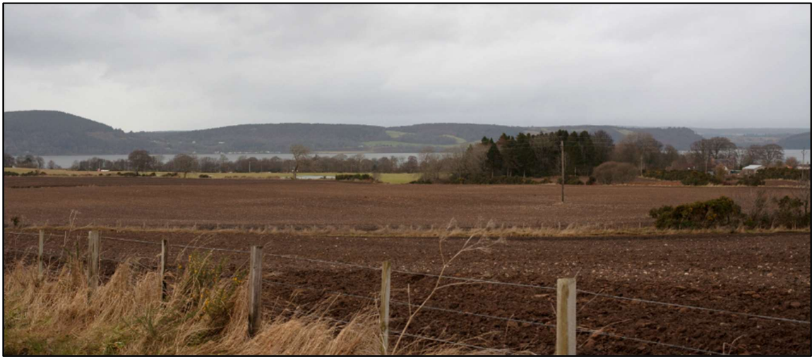
Photograph 10.5: View from Smithton Towards the Moray Firth and the Black Isle Overlooking Stratton