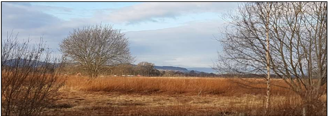
Photograph 10.11: View from the Northern Edge of Culloden Towards C1032 Barn Church Road