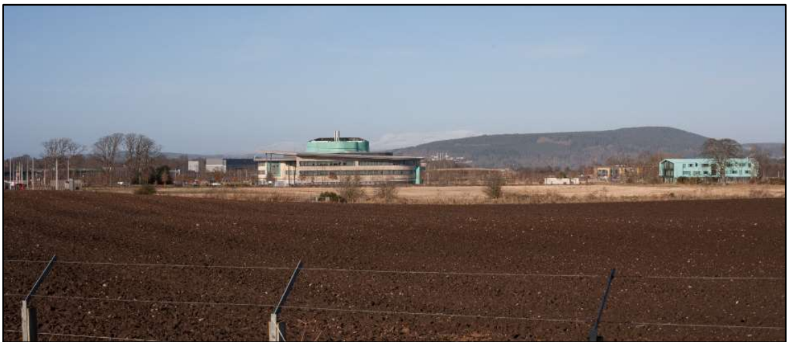
Photograph 10.7: View From U1058 Caulfield Road North Towards Inverness Campus Buildings to the North