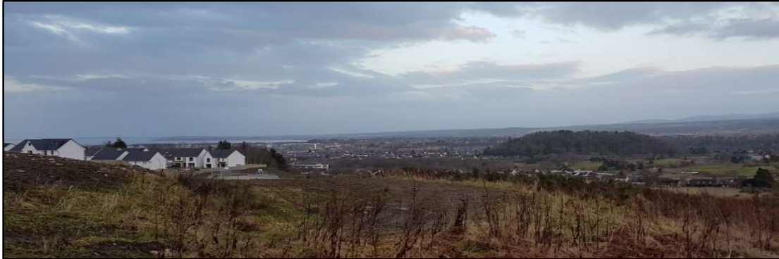
Photograph 10.1: View from the Great Glen Way Near Leachkin Looking East Towards the Proposed Scheme