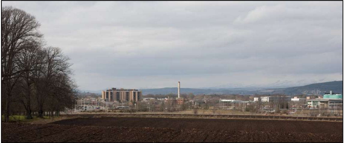
Photograph 10.10: View of Raigmore Hospital and the City of Inverness from Castlehill