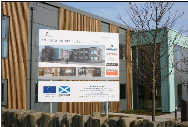
Photograph 10.14: View of Solasta House Under Construction