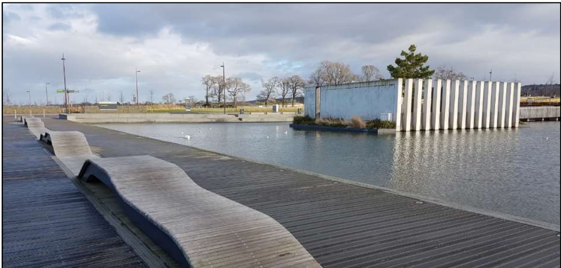
Photograph 10.18: An T-Eilean Open Air Gallery and Performance Space within Inverness Campus