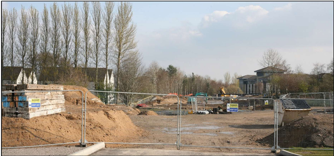
Photograph 10.19: View of the Public Transport, Cyclist and Pedestrian Bridge under construction from Inverness Campus