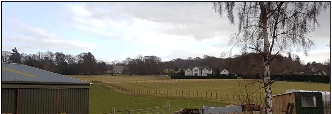
Photograph 10.9: View From Inshes Holdings Looking South Towards Craggan Valley and Inshes House