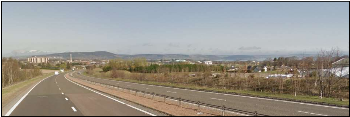
Photograph 10.16: View from the A9 at Inshes looking north towards Inverness