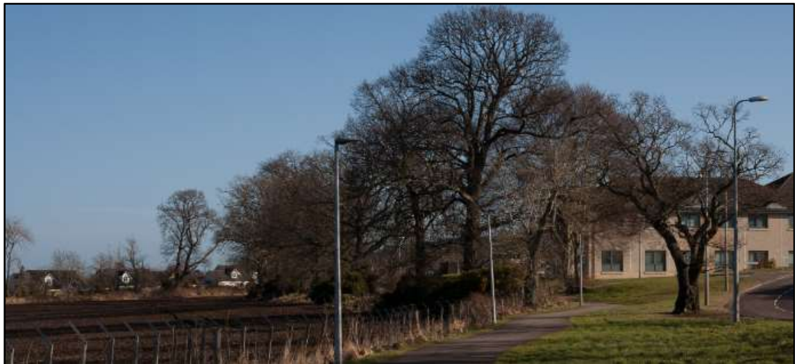
Photograph 10.2: Cradlehall Meadows (left) and Cradlehall Business Park From U1058 Caulfield Road North / NCN Route 1