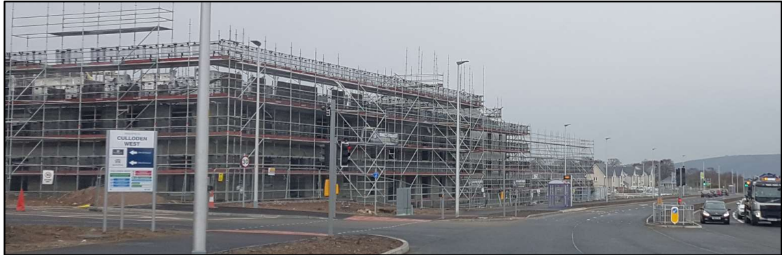
Photograph 10.13: View of Phase 1A of the Stratton Development currently under construction viewed from C1032 Barn Church Road