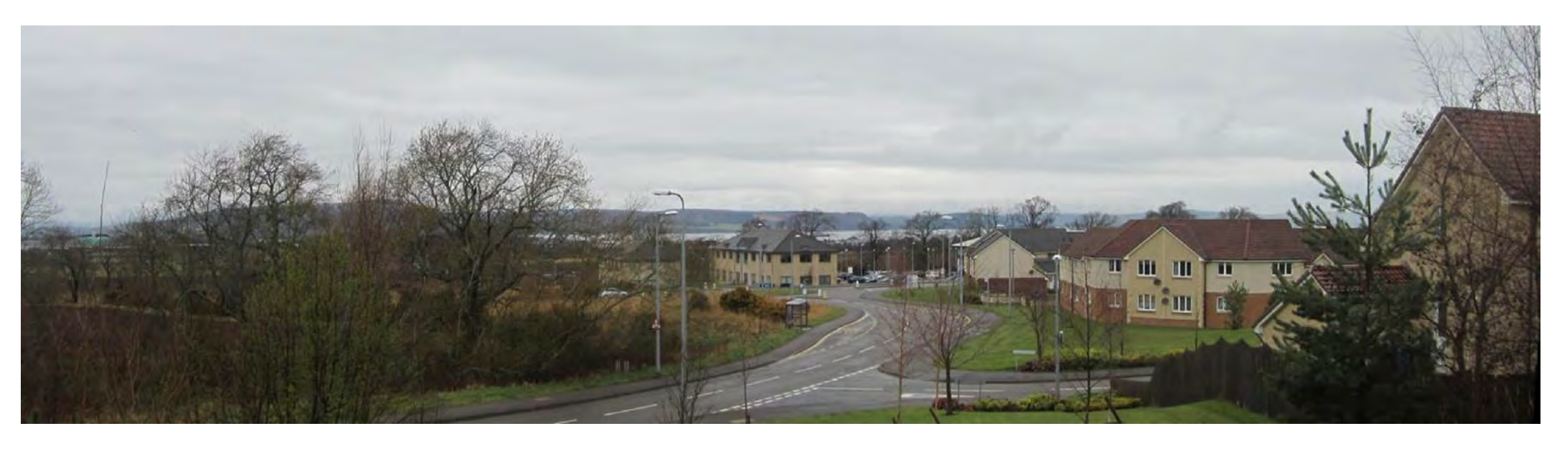
Viewpoint 1- Inverness Urban Fringe and Culloden Local Landscape Character Area