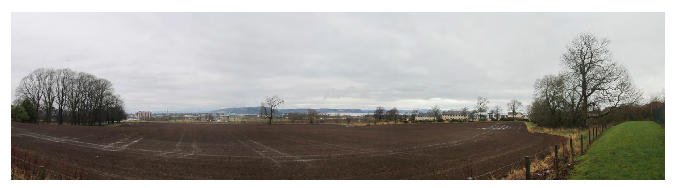
Viewpoint 2 - Enclosed Farmed Landscapes Local Landscape Character Area