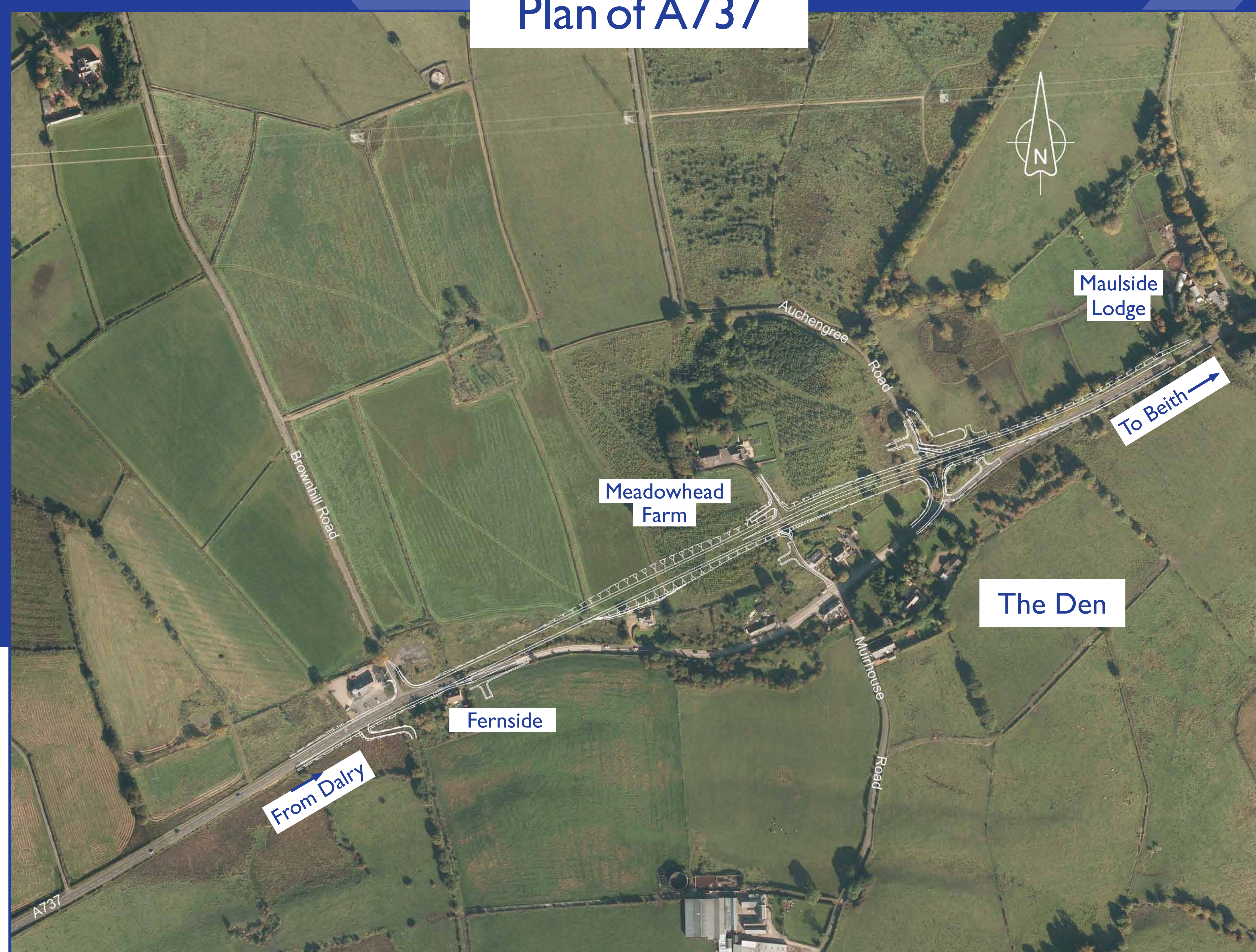
Plan of A737

Access to No 27 The Den will remain at the existing location on the de-trunked section of the existing A737.