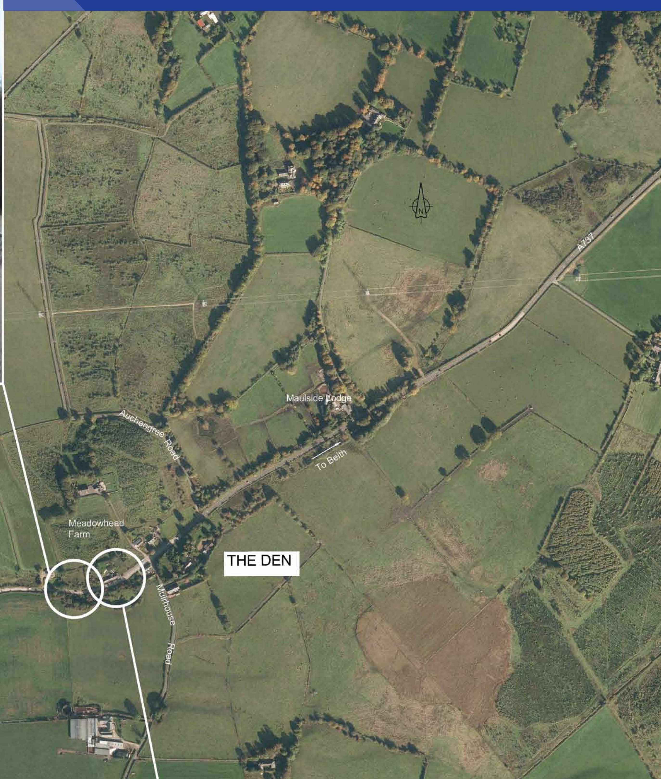
Close Proximity of Properties to the Edge of Carriageway of the Trunk Road