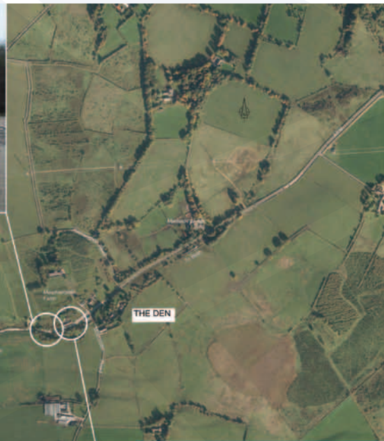
Close Proximity of Properties to the Edge of Carriageway of the Trunk Road