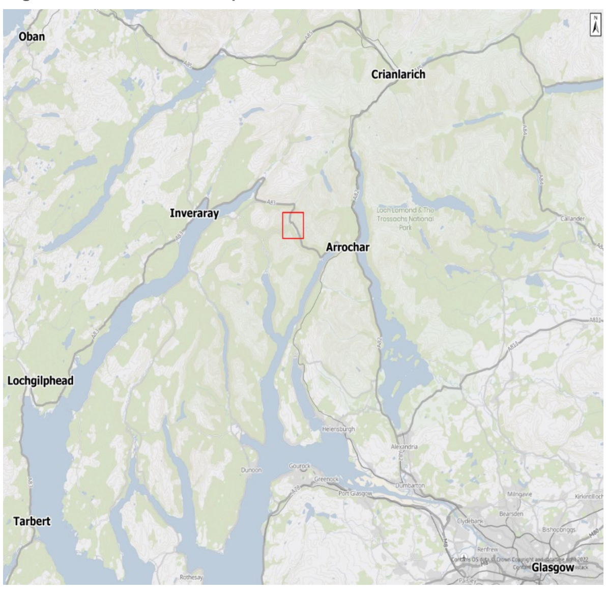
Figure 1 - location of the Proposed Scheme

1.1.4. In line with the recommendations of <u>Strategic Transport Projects Review 2 (STPR2)</u> and following major landslide events at the Rest and Be Thankful in August and September 2020 (the largest recorded in the area), the then Cabinet Secretary instructed Transport Scotland to investigate a long-term, resilient, and sustainable solution to the problem of landslides in Glen Croe. The Access to Argyll and Bute (A83) project team was commissioned with developing a resilient and sustainable road to Argyll and Bute to address the landslide issues at the Rest and Be Thankful.