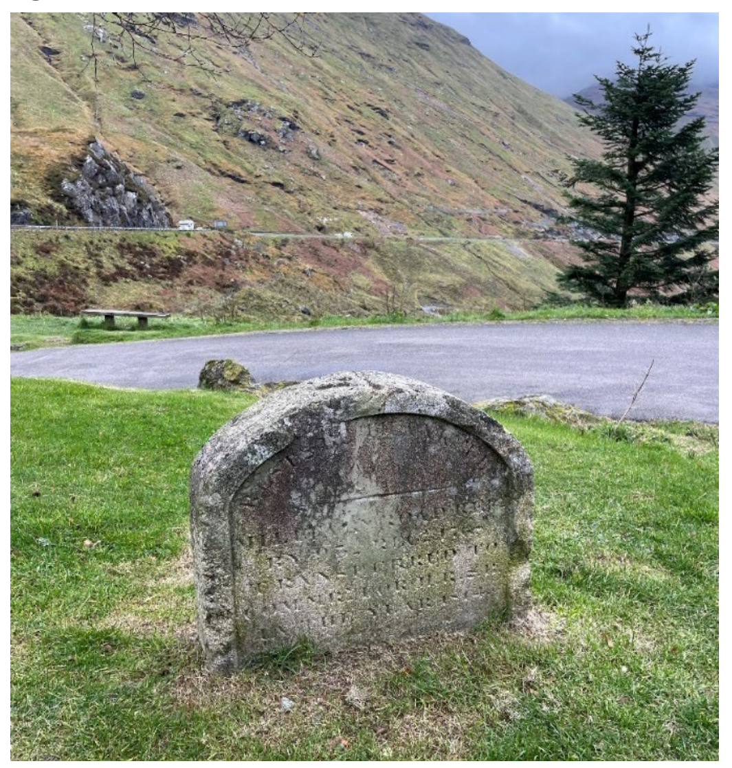
Figure 4 – Rest and Be Thankful stone

File Name: A83AAB-AWJ-EAC-LTS_GEN-RP-LE-000223