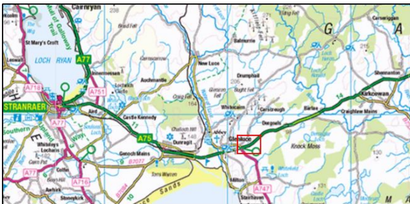
Figure 2 - Scheme Location