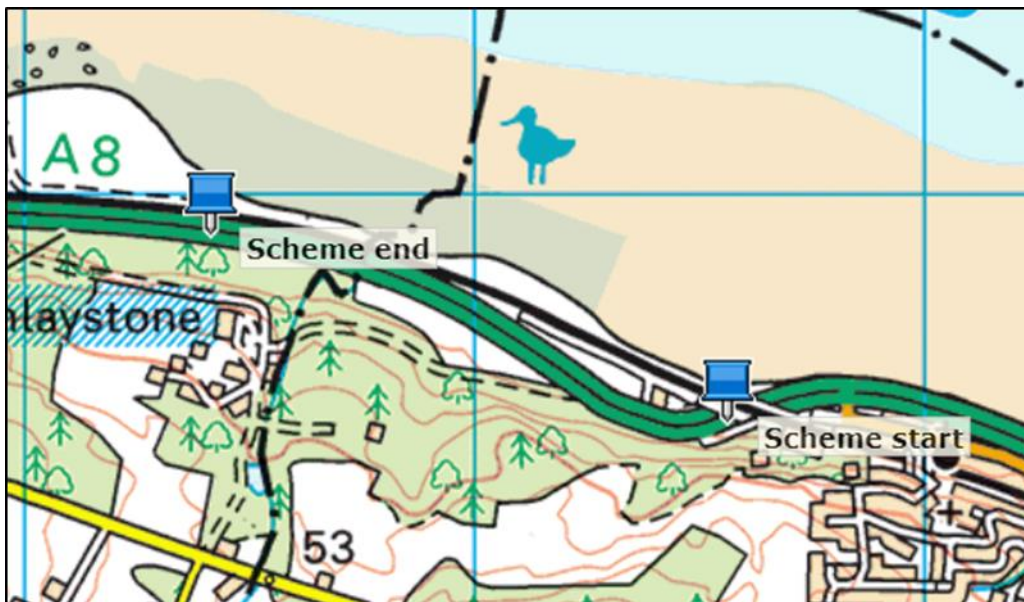
Figure 2 - Scheme Extents